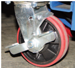
▶ Casters With Brakes