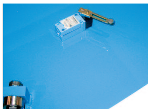
▶ Limit switch

OPTIONAL ROTATIONAL LIMITS FOR POWERED TURNTABLES: LIMIT SWITCHES, PROXIMITY SENSORS, PRECISION CONTROL PLC