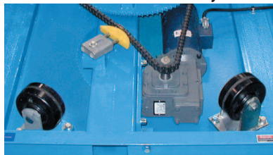
▶ Lifetime lubricated roller bearing wheel style of unit