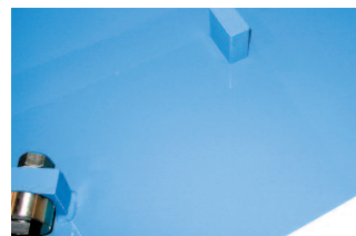
▶ Hard stop