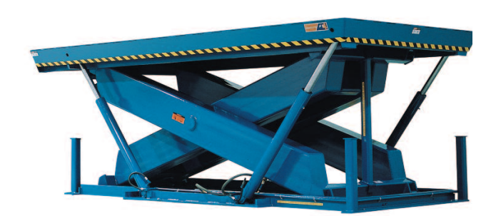
25,000 lb. Capacity - 12 x 20 ft. Platform

Capacity: 25,000 lbs. Platform Size: 12 x 20 ft. Max. End: 20,000 lbs. Loading Sides: 17,500 lbs. Travel: 58 in. Lowered Height: 30 in. Raised Height: 88 in. Approx. Speed Up: 72 sec. External Motor: 10 HP Shipping Weight: 18,000 lbs.