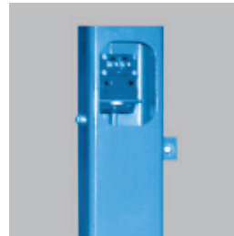
▶ Standard Electronic Eye.