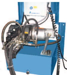
▶ Continuous Duty Power Units.