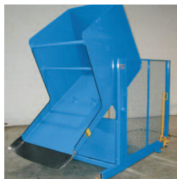
▶ Optional Chutes & Soft Lips.