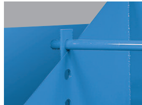
▶ Adjustable retaining bar