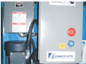
▶ Standard power unit