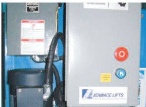
▶ Standard power unit