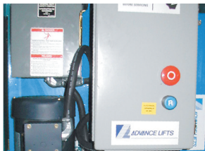
▶ Standard power unit